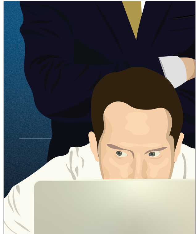
COVER AND FEATURE ILLUSTRATIONS BY: TRUJILLO DESIGN

Plaintiff's counsel attempt to augment their tort cases by appealing to the jury's reptilian survival instincts, urging them to "do the right thing" or "teach a lesson" rather than focusing on the actual facts at hand. Municipal defendants need to recognize these tactics and defeat them. PAGE 14